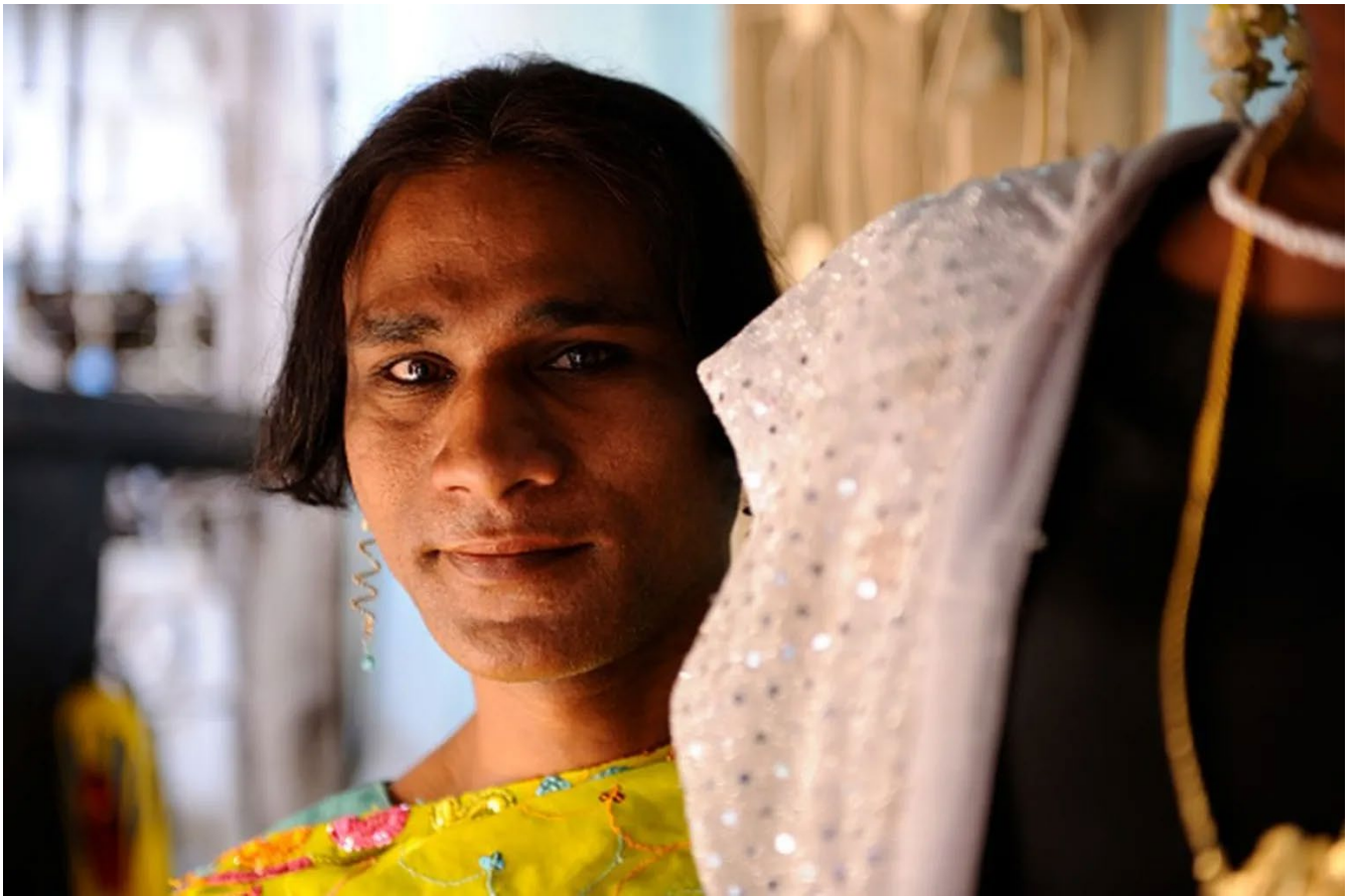
A member of the hijra community of Mumbai