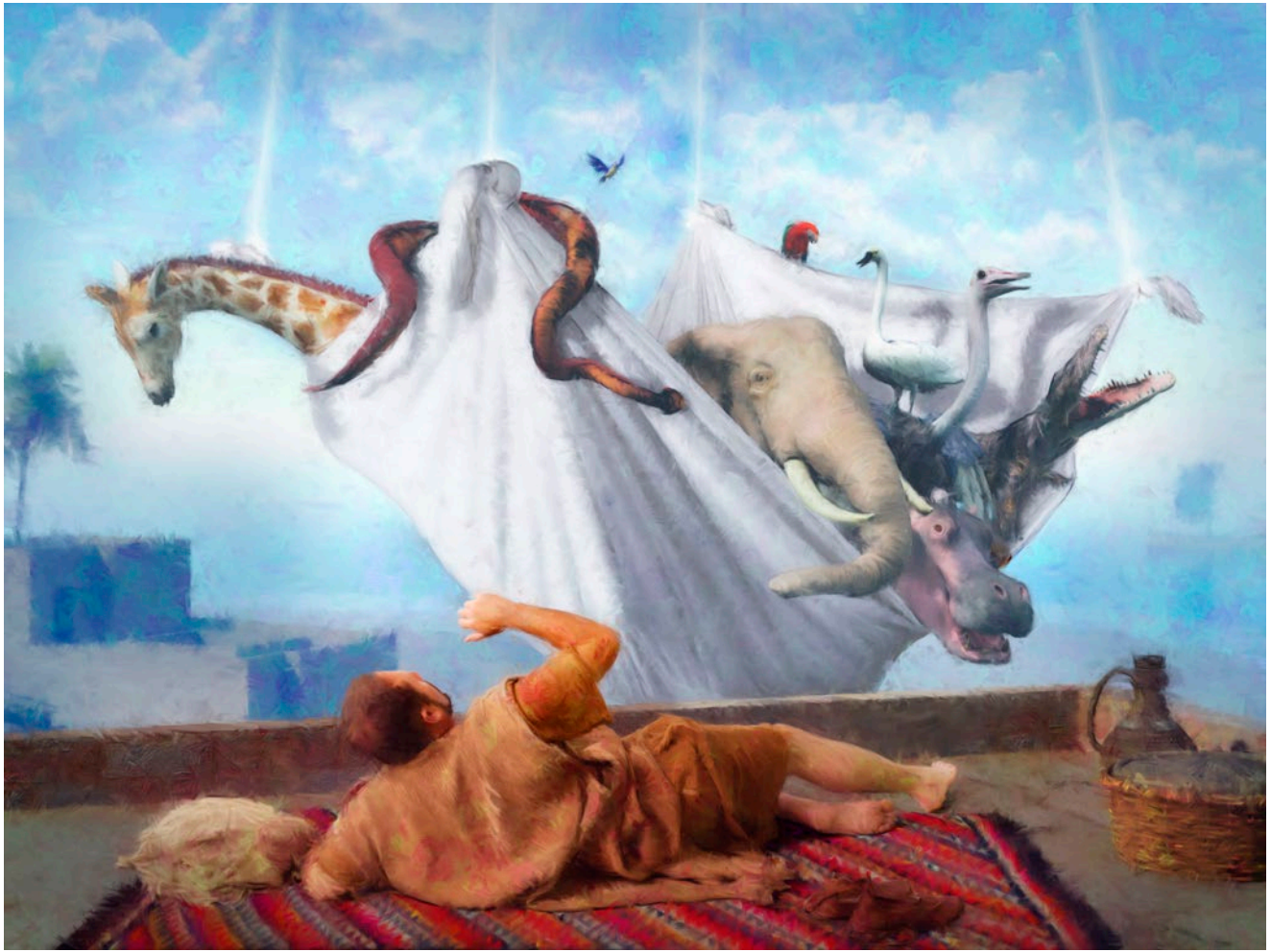
Peter's Vision , Oxygen Multimedia Ministries