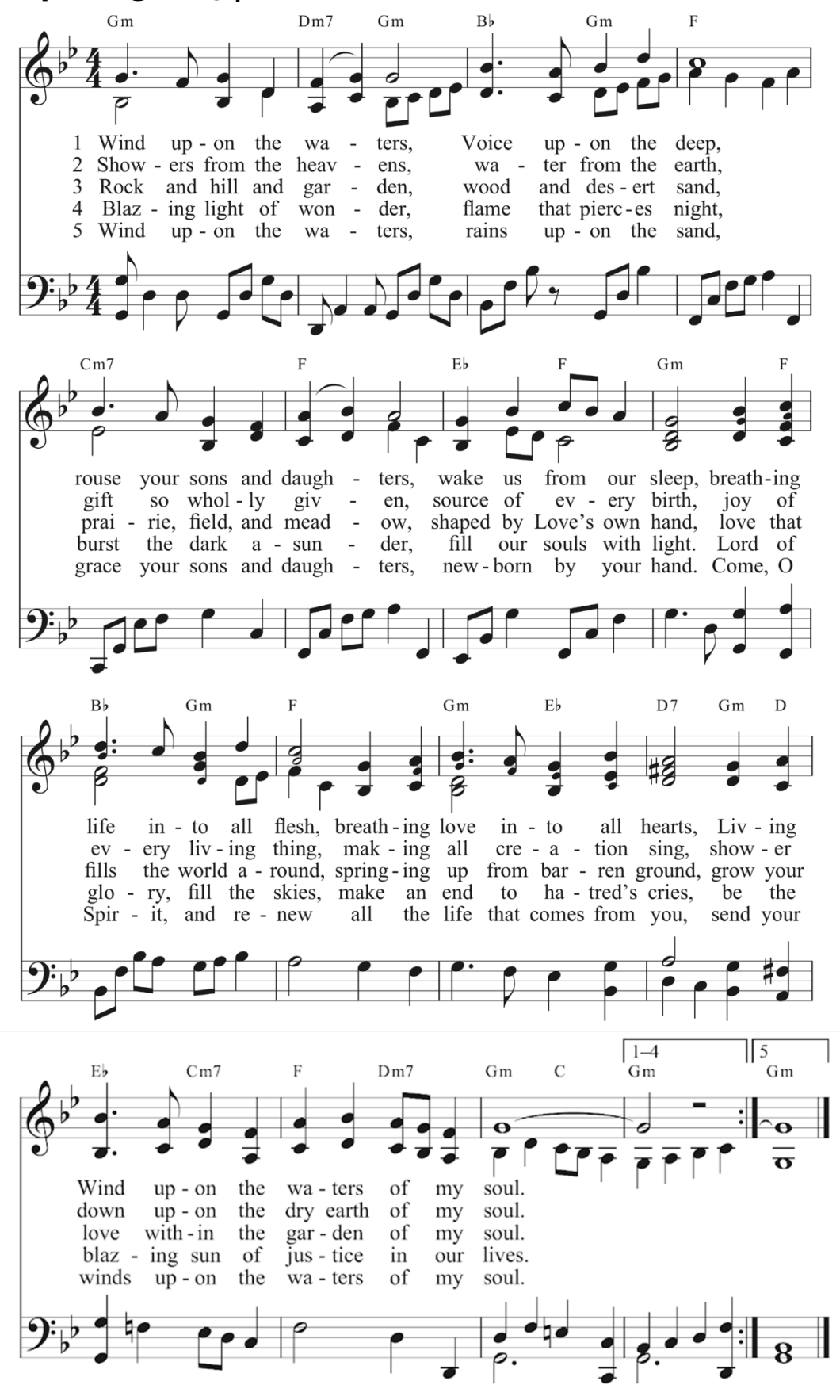
Words and Music: Marty Haugen, 1950-. Words and music © 1986 GIA Publications, Inc.