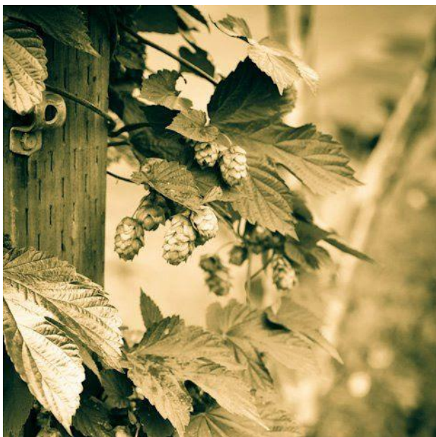
“Hops” Ronda Broatch